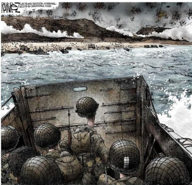
The GREATEST GENERATION

I mean, what did he think was going to happen? Did he think some soulless, multibillion-dollar Silicon Valley corporation was going to display company-wide wisdom and woke insightfulness while implementing his agenda to censor obnoxious voices? Did he imagine that YouTube executives were going to sit down with him over a cup of coffee and go down a list with him to get his personal opinion of who should and should not be censored?