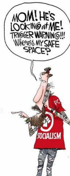
The LATEST GENERATION michaelpramirez.com

Think about it. How narcissistic do you have to be to assume that a vast corporation is going to use your exact personal perceptual filters while